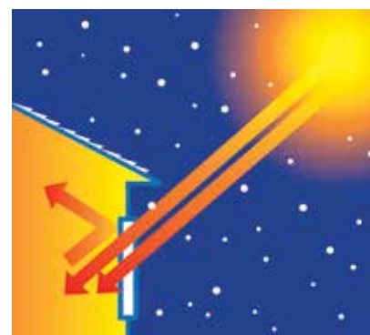
In winter months, Low-E glass lets warm solar rays into your home, while helping to prevent indoor heat from escaping.

†Also available with lower insulating gas and Double Low-E options.