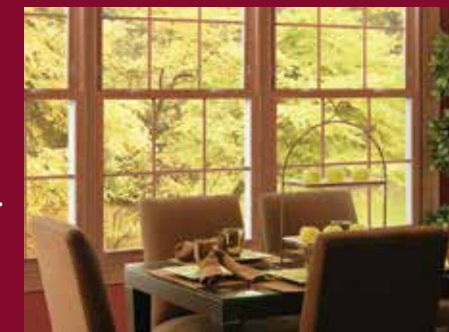
A dual-glazed slimline design is also available.

†Also available with lower insulating gas and Double Low-E options.