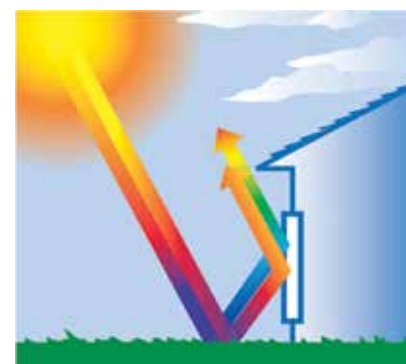
During summer, Double Low-E glass filters long-wave radiation from the sun to reduce solar heat gain and keep your home cooler.